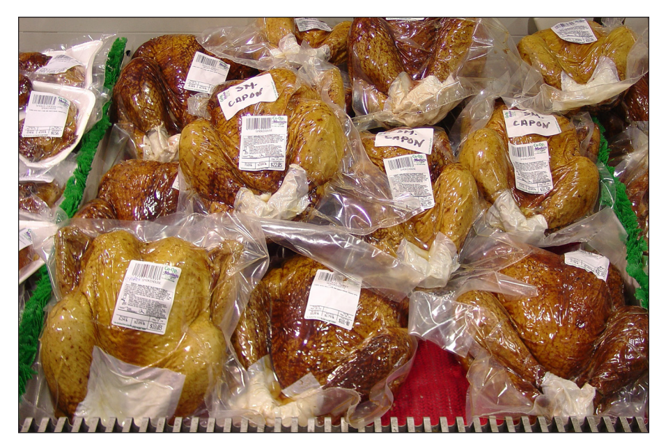
Figure 2. Smoked capons in the display case of a store. Jacquie Jacobs.

When chickens take longer to reach market weight the older meat tends to become rather coarse, stringy, and tough as the rooster ages. Caponized males grow more slowly than normal male chickens and accumulate more body fat. Deposits of fat in both the light and dark meat of capons is greater than that of intact males resulting in a meat that is more tender and juicier. The older the age at which capons are slaughtered the more flavorful the meat. With major improvements in the genetics of meat breeds, caponization is not necessary. The fact it is a surgical procedure makes it difficult and expensive and raises ethical concerns.