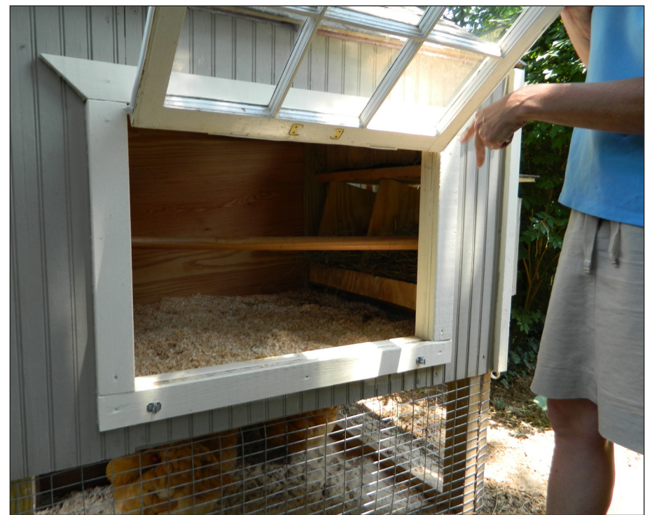
Figure 1. This chicken house is ideal for a trio of hens. They have shelter from the weather and a run to go into for fresh air. The chicken house has wood shavings for bedding, a perch, and nest boxes which can be accessed from the outside for easy egg pickup. The window on the side can be opened for easy clean out of the house interior. The feed and water are provided outside, to encourage them to use the run. The run has a sand base which is cleaned out regularly, much like a litter box. The run is completely covered with wire to provide protection from predators. The run could have been a little taller to make cleanout of the run easier, but it is functional as is.