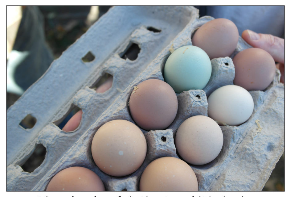
Figure 5. A dozen of eggs from a flock with a mixture of chicken breeds.