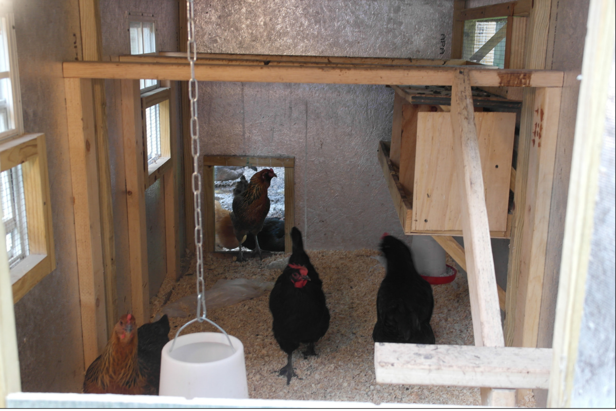
Figure 2. This larger, mixed flock of hens is provided with a larger chicken house and run. Again, wood shavings are used as the bedding. The nest boxes are accessible from the outside for easy egg pickup. While the feed is indoors, the water is outdoors. The perches extend over the nest boxes which can be a problem requiring the tops of the nest boxes to be cleaned on a regular basis to prevent build up and odor problems. Again the run is completely covered to protect the hens from ground and aerial predators.