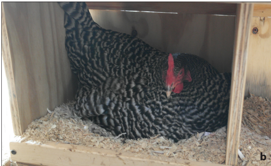
Figure 3. Examples of perches (a) for a small poultry flock and nest boxes (b) for a small laying flock.