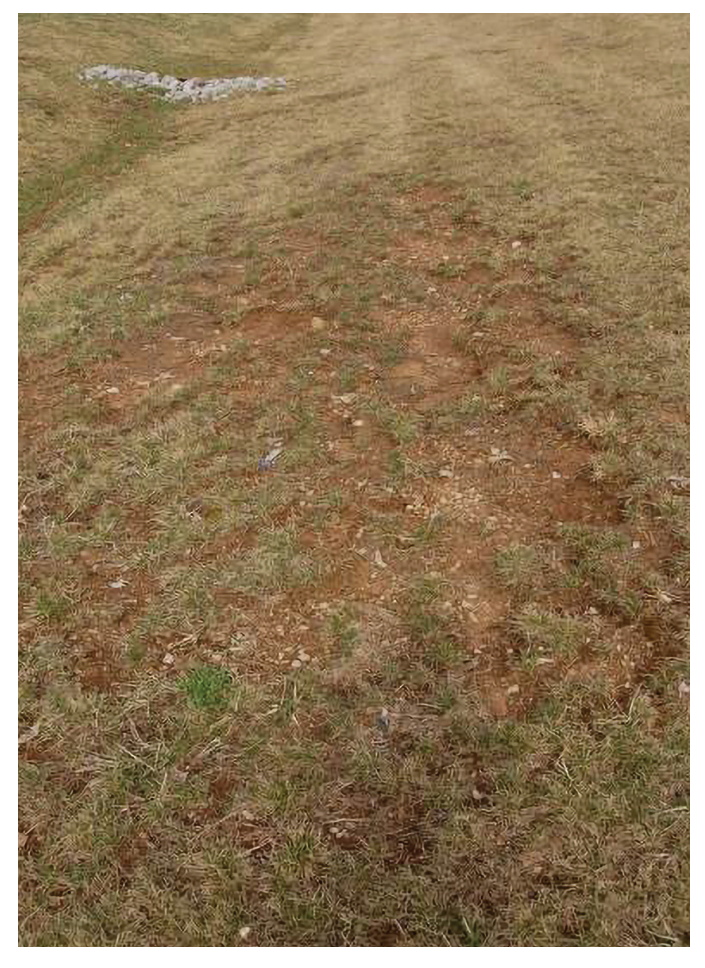
Erosion is present on the side slope of this grass swale.