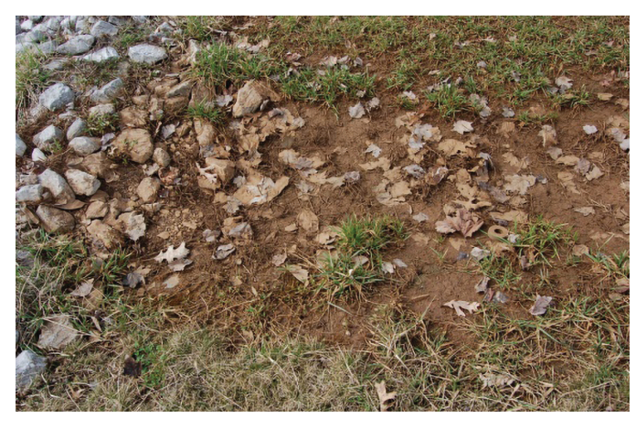
Evidence of sediment deposition next to riprap. Excess sediment reduces stormwater infiltration into the underdrain.