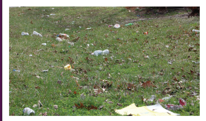
Trash and debris accumulate in a grass swale. Trash and debris should be removed after every rain of more than one inch.