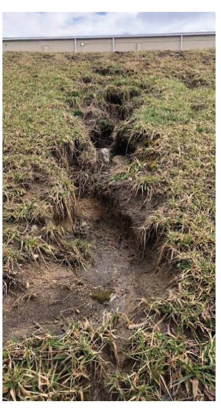
Concentrated stormwater flow has eroded sediment from the embankment, forming a gully.