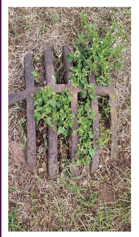
The outlet is being buried in sediment and vegetation.