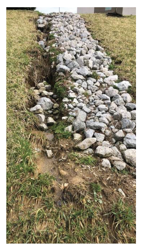
Stormwater erosion has formed a gully on the left side of the forebay.