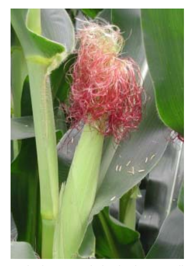
In dual-purpose hybrids, the ear will compose one-third of the total forage weight when harvested for silage.

Deep ripping is an option for fields that have a compaction layer beneath the soil surface but above the depth of the ripper shank. Deep ripping should occur only in fields where the compaction layer can be alleviated by the deep ripping implement. Soils should be deep-ripped