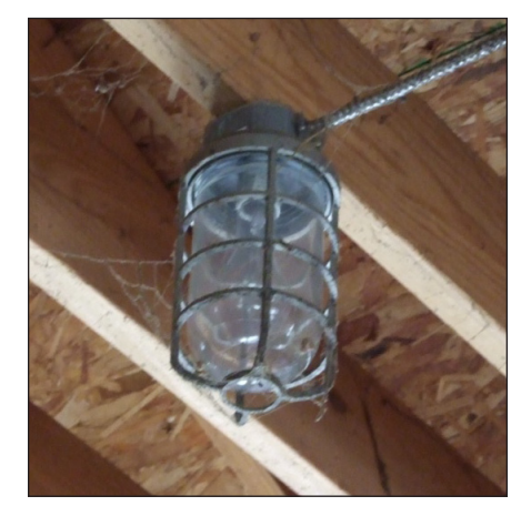
Light bulbs should be caged to prevent