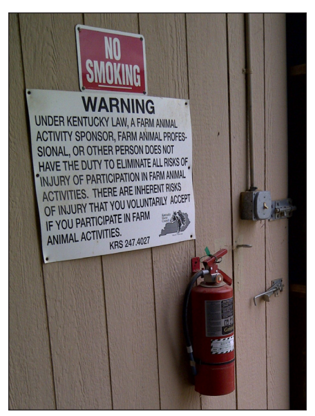
Fire extinguishers should be properly maintained and annually tested.

Under the fire department's supervision, remove the hay from the barn. If any fires ignite as a result of exposing the smoldering hay to oxygen, the fire department can put them out.