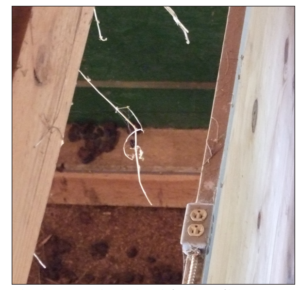
When hay is stored in the barn loft, pieces of hay may accumulate on the trusses and may fall inside the electric outlet, creating a spark and possible fire.