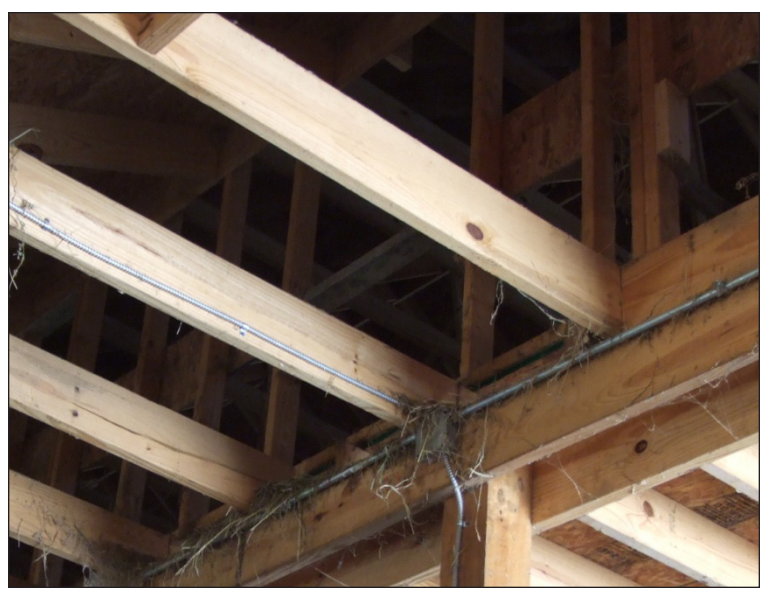
If possible, do not store hay in the barn loft. It makes cleaning more difficult and provides excellent fuel for spreading fires.