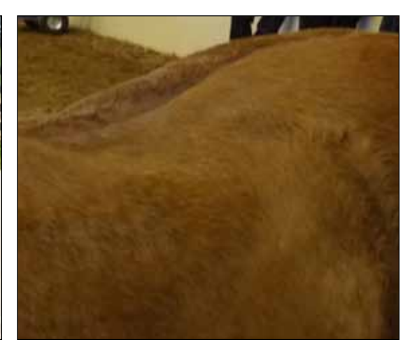
Figure 9. Horse has a loin area scoring above 5. The positive crease is easily seen.

Loin. The loin is the area of the back just behind where the saddle sits. At a condition score of 5, the loin area will be relatively level-the spine is not sticking up, nor is there a dent or crease along the spine. At condition scores below 5, the spine starts to become prominent; this is