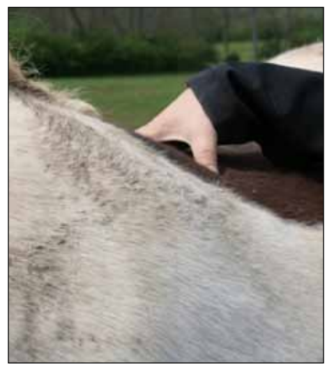
Figure 6. Horse has withers scoring above 5.