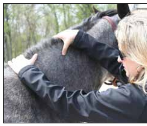
Figure 12. Assessing the neck.

Neck. In a very thin horse, you might be able to see the bone structure of the neck. As the horse gains condition, fat will be deposited on the top of the neck. At a condition score of 5, the neck blends smoothly into the body. Body condition scores of 8 and 9 are characterized by a neck that is thick all around with fat evident at the crest.