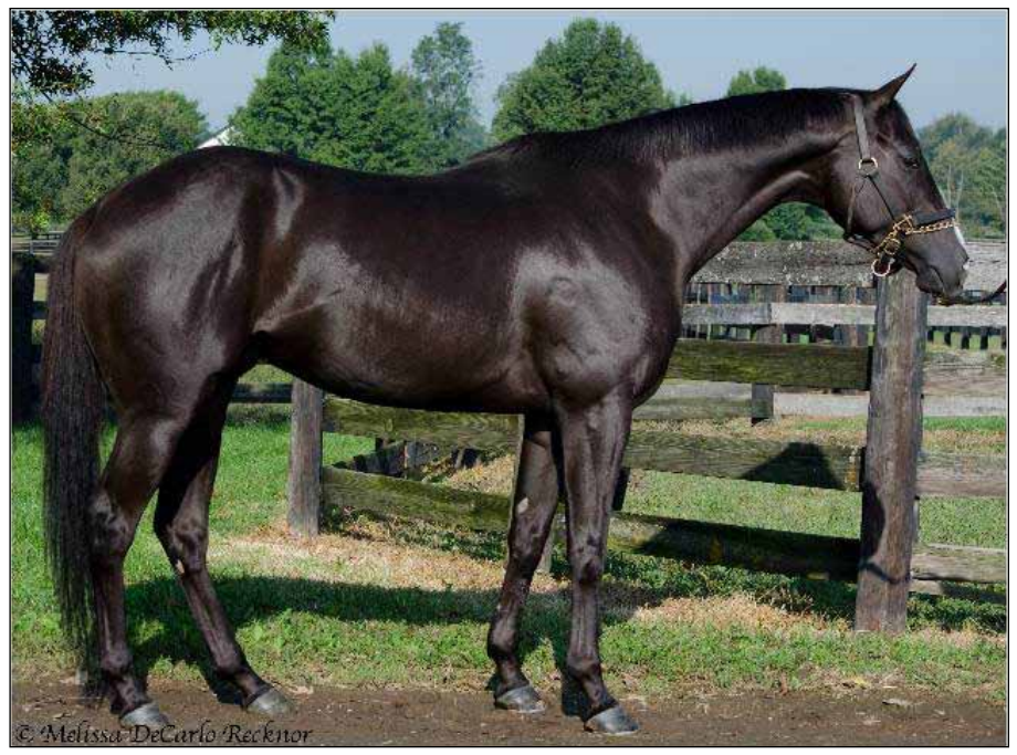
Figure 14. Horse has an overall BCS of 5. He is in moderate body condition, his neck blends smoothly into his body, the withers are rounded over the spinous processes, and the loin is level with no positive or negative crease. Ribs cannot be visually distinguished but can be easily felt, and the shoulder blends smoothly into the body.

Think about calories first: A mature horse will lose weight and condition when the number of calories it consumes is less than the number of calories it uses. Therefore to decrease body condition the horse must either decrease calorie intake, or increase calorie use (or both). It isn't healthy to starve a horse into weight loss,