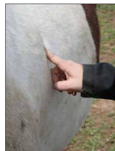
Figure 4. Horse has a shoulder scoring above 5.