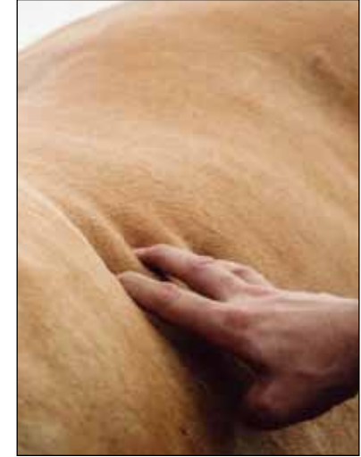
Figure 2. Horse has ribs scoring above 5.