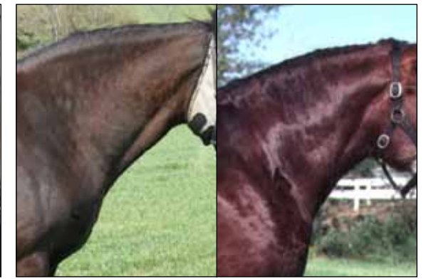
Figure 13. These horses have necks scoring above 5.