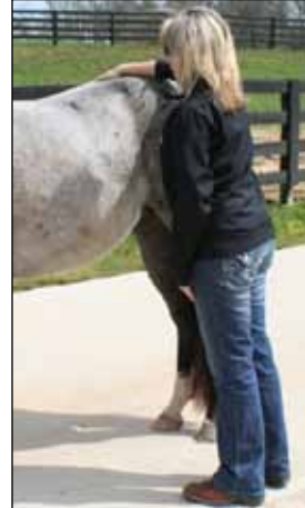
Figure 8. Assessing the loin area.