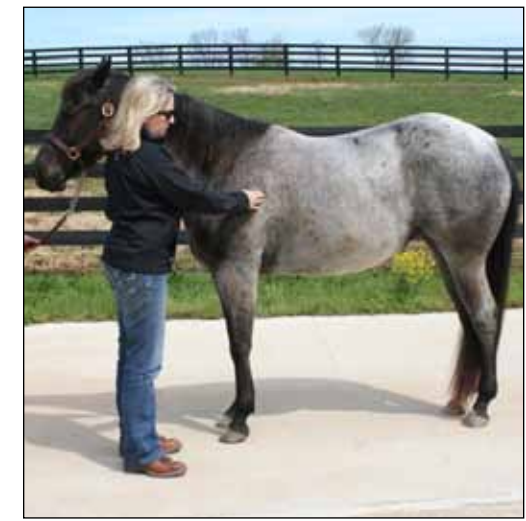
Figure 3. Assessing the shoulder.