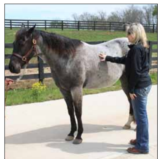
Figure 1. Assessing the rib area of a horse.

Withers. If a horse is very thin, no fat will be deposited between the top of the shoulder blade and the spinal vertebrae, making the two structures easily discernible. As the horse's condition score increases, fat fills in between the top of the shoulder blade and spinal vertebrae; so at a condition score of 5, the withers will appear rounded. As horses approach the high end of the condition scoring scale, the withers will be bulging with fat.