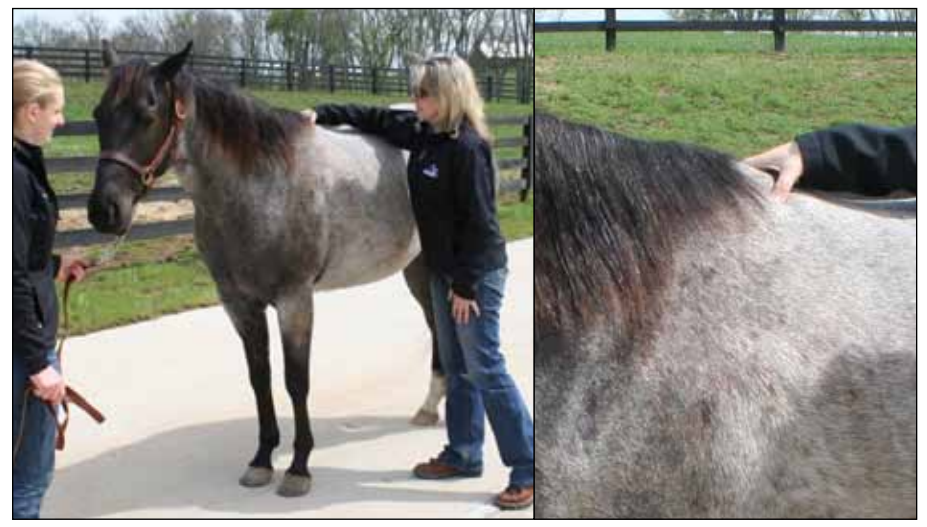
Figure 5. Assessing the withers.