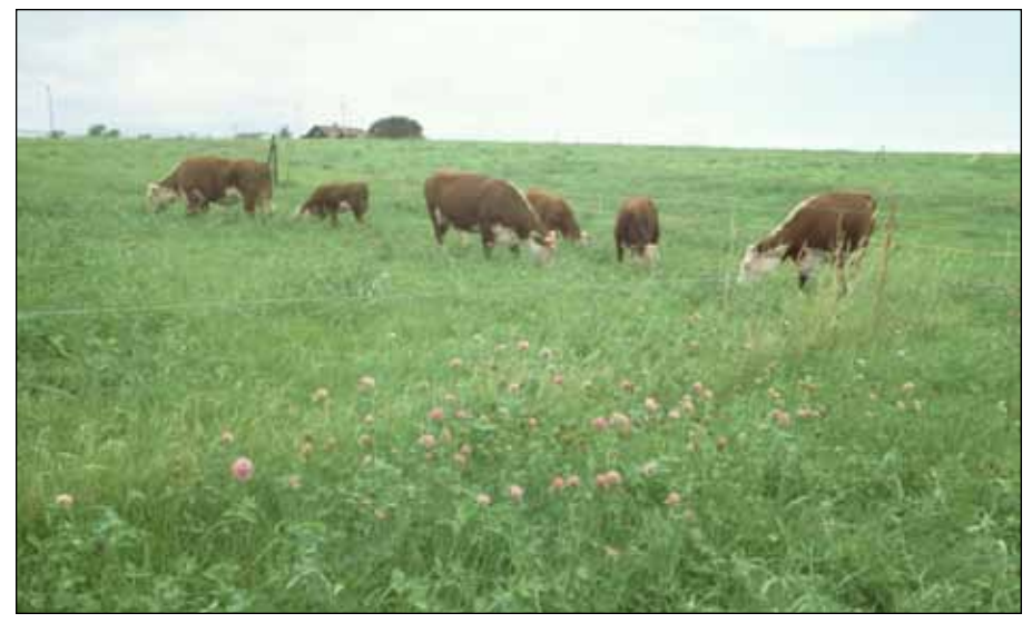
Rotational grazing keeps pastures higher in quality than does continuous grazing and favors the growth and persistence of legumes.

Utilization: Most pastures contain a great deal of forage that is never consumed and eventually decays. Traditional continuous grazing systems may use only 30 to 50% of the available forage. The rest of the forage is either trampled, soiled, or of little value because it overmatures or dies. Most of this loss occurs with underutilized fall stockpiles and during periods of rapid growth where there is surplus beyond what is needed for livestock. When the appropriate stocking density is used, shortening grazing periods to three to seven days increases utilization 50-65%; to two days, 55-70%; and to one day, 60-75%.