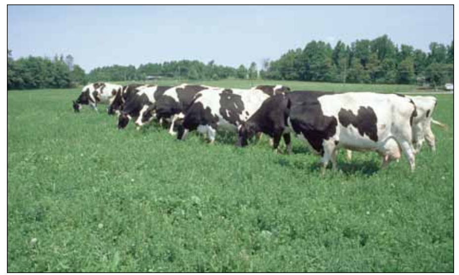
A good rotational grazing system allows the use of high-quality forages such as alfalfa, which requires rest periods after grazing and in the fall.

University of Missouri researchers have conducted several studies over the past five years on fertility and manure management in pastures. Their work resulted in the following conclusions, summarized here: