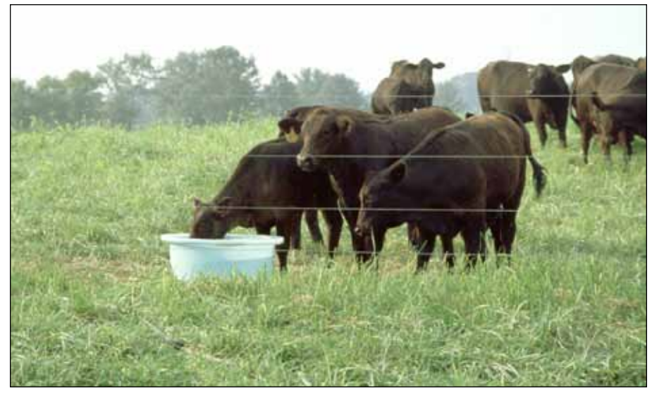
Temporary or seasonal water systems can reduce distance traveled to drink and increase pasture utilization. Small to medium-sized tanks can easily be moved from paddock to paddock.