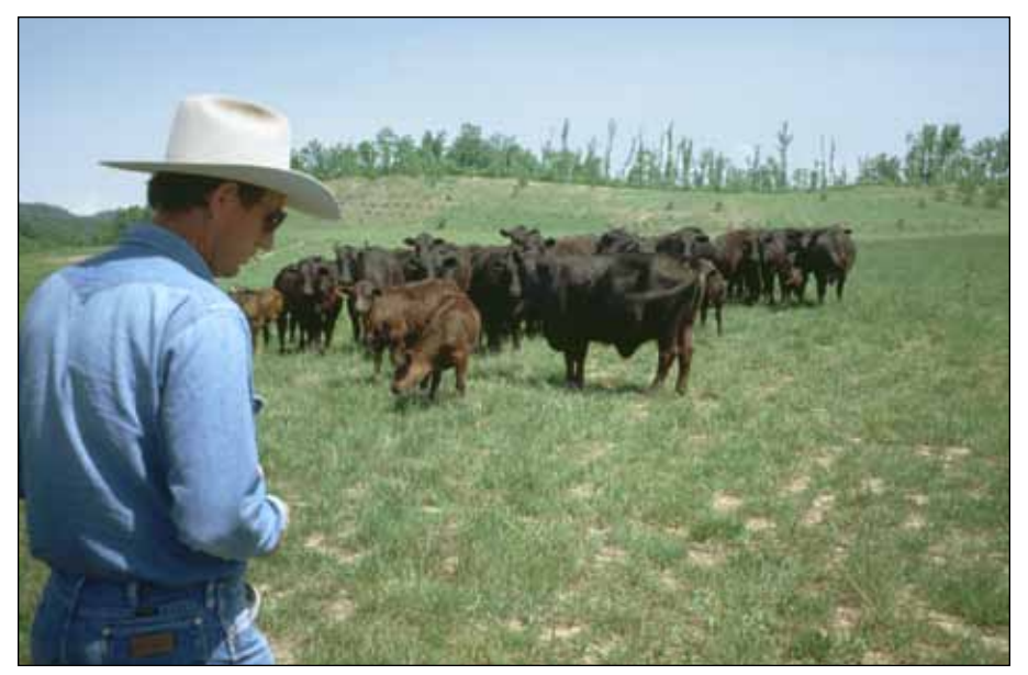
Rotational grazing allows the manager to make the best possible match between animal needs and forage production, as on this reclaimed mine site in Perry County.