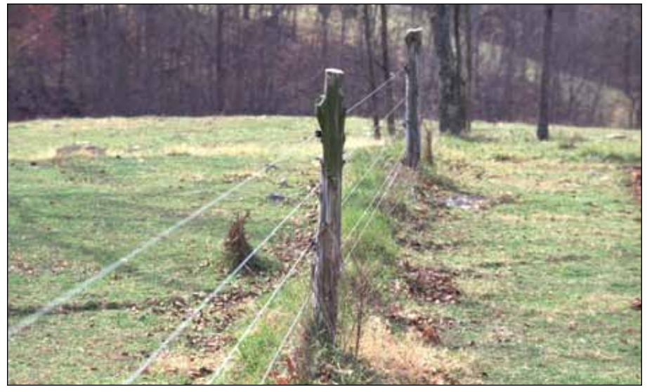
High-tensile electrified wire is a viable and economic alternative to conventional fencing materials such as woven wire, and it enables a fencing system to be built more quickly.

An efficient grazing management plan should attempt to match pasture growth to animal needs and offer the potential for minimum pasture to be harvested and stored as hay or silage. Livestock systems managed for reproduction will have the greatest forage needs in the birthing and breeding season; forage needs will drop off after weaning. Spring-calving/ kidding herds need the quality and quantity of spring and early summer pasture but must rely on stored forage in late winter. Fall-calving/kidding herds rely more on hay or silage and forage crops