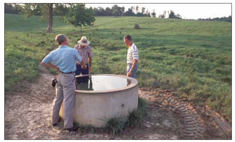
An effective water distribution system is essential to the grazing system. This permanent water tank was developed from a spring and provides an inexpensive source of water on a Metcalfe County farm.

wire. Some newer braided wires have more steel (thus less resistance), so they can be used in longer runs.