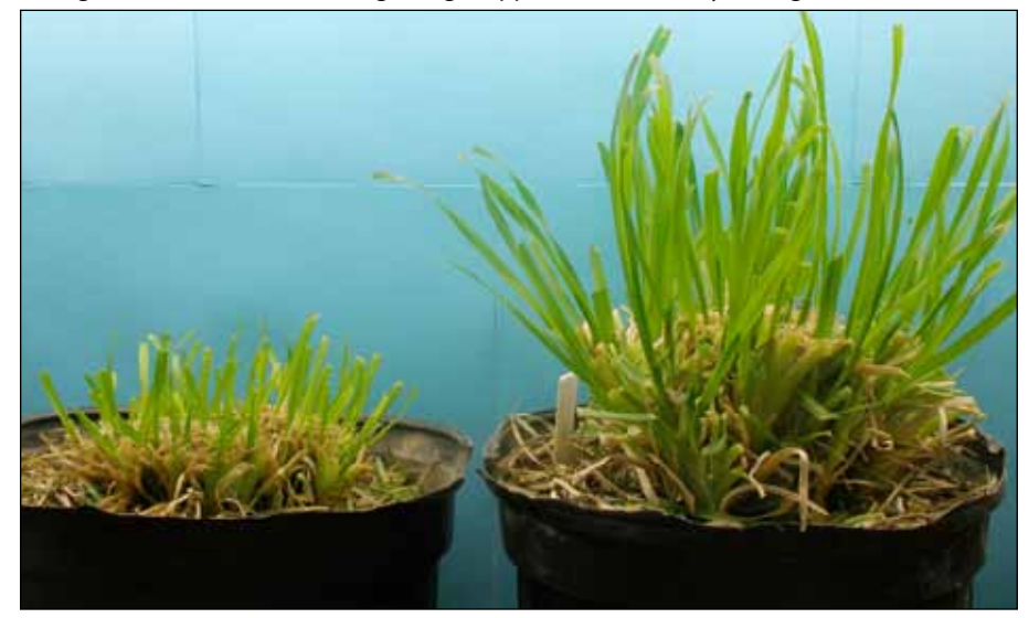
Figure 2. The orchardgrass plant on the left was clipped weekly to 1 inch for one month to simulate continuous grazing. The orchardgrass plant on the right was clipped at the beginning and end of the month to 3.5 inches to simulate rotational grazing. For the plant on the right, the value of rotational grazing is apparent after six days of regrowth.

changing the method of grazing from continuous to weekly or daily rotations increased the persistence of big bluestem. University of Georgia researchers reported that repeated close grazing of endophyte-free tall fescue caused a weakened stand. However, the fescue survived in those endophyte-free pastures that had 4 inches of residual growth maintained across the season.