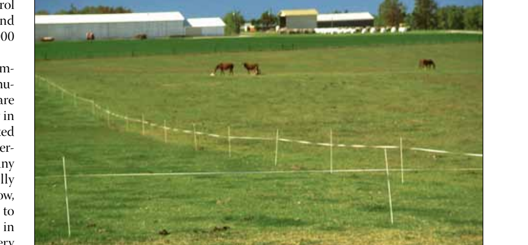
Electrified polytape (available in widths up to 1½ inches) is very visible and can be used for subdivision fencing for horse pasture. The twist in the polytape makes it flutter in the wind, resulting in greater visibility.