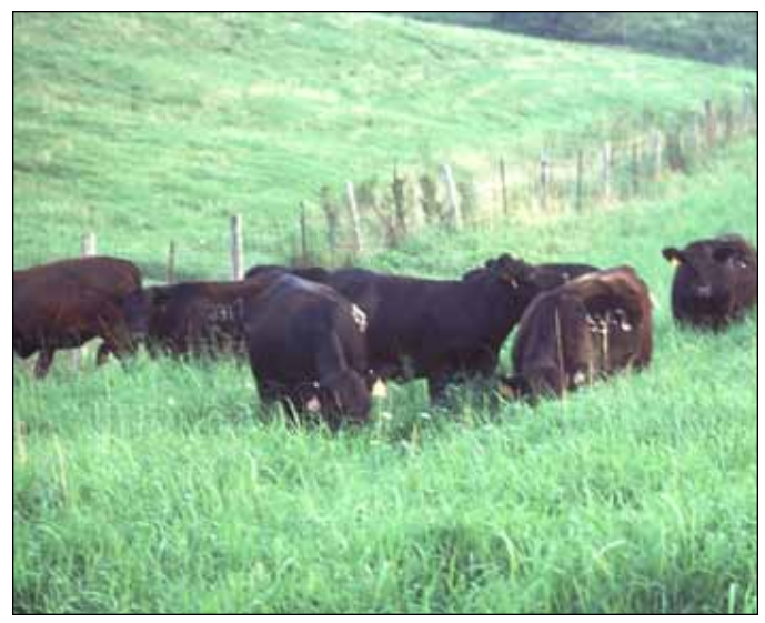
Both cool- and warm-season forages are needed for a sound grazing system. This field of switchgrass in Owen County provides summer pasture for these stockers and complements tall fescue, which is used in spring and fall.