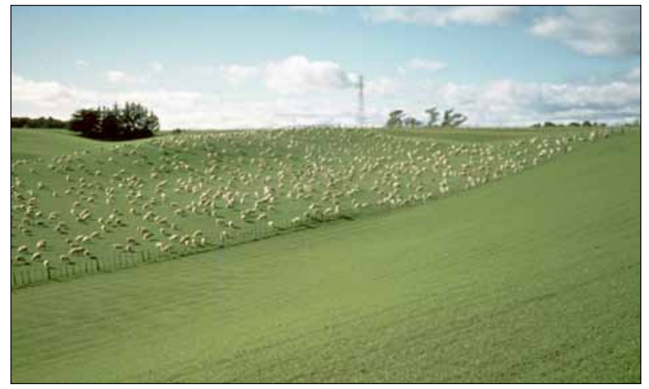
Rotational grazing enables managers to use high stocking densities and short grazing periods to increase utilization and decrease animal selectivity in grazing.

In most situations, the best way to start is to make a few simple or basic improvements in the current grazing system, which will begin the learning curve and allow the manager to develop the rotational system at a comfortable pace. It will also minimize "improvements" that later prove to be less than optimal. A lot of progress can be made by simply closing