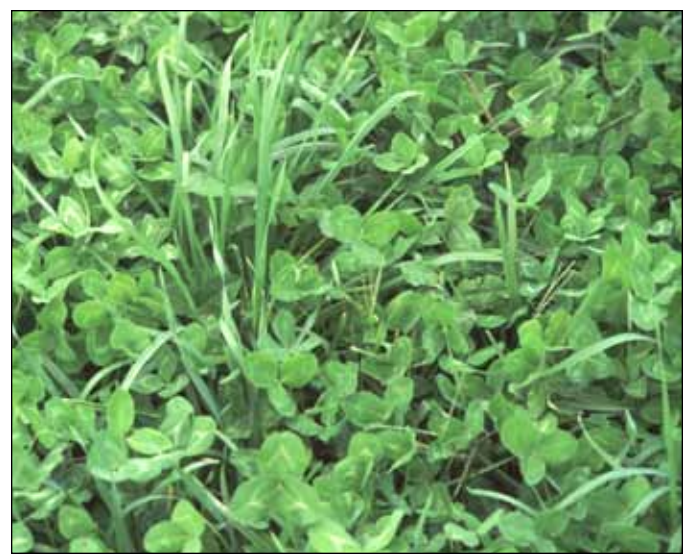
A leafy, high-quality mix of grasses and legumes can be achieved through well-managed rotational grazing.