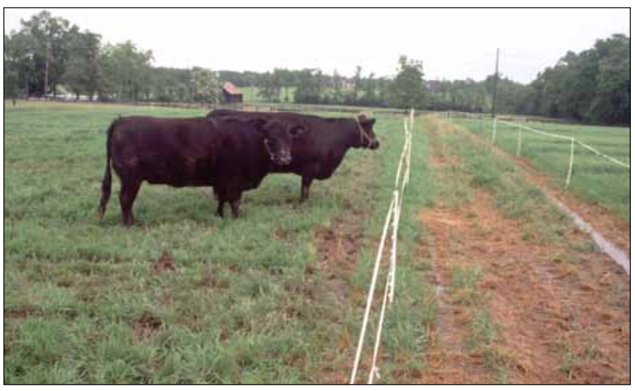
Temporary fencing materials such as tread-in posts and electrified polytape allow for quick subdivision of existing pastures.

that provide pasture in fall and winter. Fall pasture options include stockpiled tall fescue, small grains, turnips or other brassicas, and annual ryegrass.