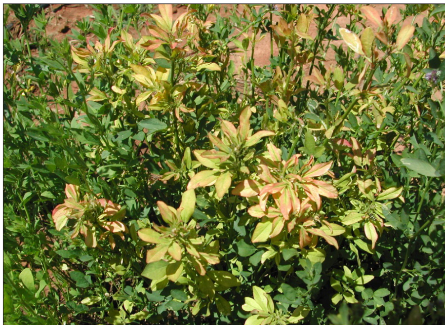
Figure 3. Boron deficiency symptoms in alfalfa (photo courtesy of Steve Phillips, International Plant Nutrition Institute).

Luxury consumption of potassium by forage crops is a phenomenon that should be understood by all forage producers. Simply put, luxury consumption refers to the plant uptake of K in excess of the plant needs. This can occur when a plant is supplied with more than adequate amounts of K. When an alfalfa plant is adequately fertilized, the K concentration in the tissue is usually between 2.0 and 3.5 percent. If the soil supply of K exceeds the needs of the crop, tissue K concentrations can be as high as 4.5 percent. For grain crops such as corn or wheat, luxury consumption is not a problem, because excessive K uptake remains in the plant tissue (leaves and stalk) and is returned to the soil with the fodder. For alfalfa and other crops where the entire plant is harvested, excessive K uptake is removed as hay or silage and is not recycled in the soil. Luxury consumption can increase K removal rates to 90 lb K 2 O per ton (55 lb K 2 O per ton is normal removal). The main drawback to luxury consumption of K is that fertilizer applied to increase soil test K can be immediately removed with the first harvest, resulting in lower than optimum soil test K levels for subsequent harvest.