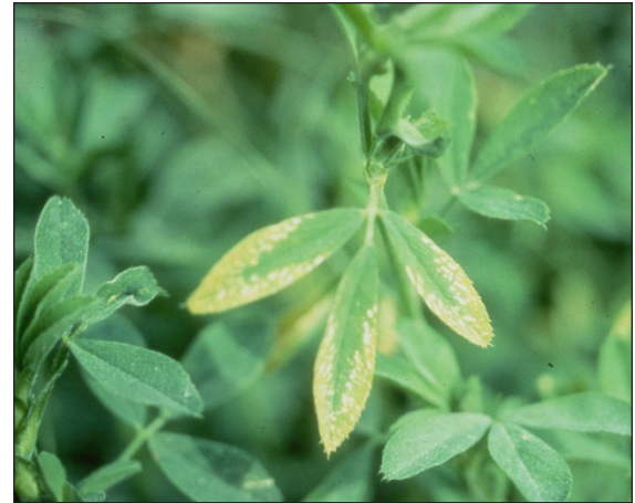
Figure 2. Potassium deficiency symptoms in alfalfa.

University research has shown that yield is not nutrient-limited when soil test levels are above 50 lb P per acre and 300 lb K per acre. Once these soil test levels have been reached, K fertilization can be based on annual crop removal or annual soil test values reported in AGR-1. In addition, AGR-1 recommends fertilization until soil test values (for the composite field sample) are 60 lb P per acre and 450 lb K per acre (Table 1). When a producer follows K recommendations in AGR-1, soil test K values will eventually stabilize at values near 300 lb K per acre. If a producer chooses to apply K based on crop removal, a good rule of thumb is that one ton of alfalfa can remove approximately 14 lb per acre P 2 O 5 and 55 lb per acre K 2 O at standard harvest moisture. A producer can apply rates of fertilizer based on the above values and tonnage of hay removed per acre. For example, if the soil test K level is between 300 and 450 lb per acre and 4 tons of hay are harvested, then 220 lb of K 2 O would be added to replace the amount removed in the harvested hay.