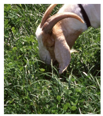
Thick, vigorous pasture stands will suppress weeds, intercept rainfall and keep plant crowns and soil cooler.