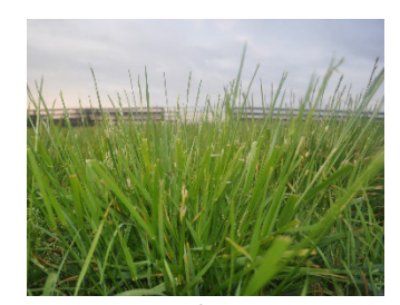
Endophyte infected tall fescue can cause heat stress, reduced milk production and lower gains in small ruminants especially in late spring and summer.