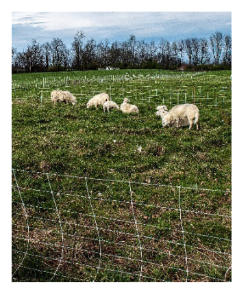
Electric fence is an effective and inexpensive way to begin rotational grazing.