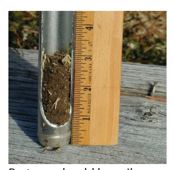
Pastures should be soil sampled to a depth of 3 to 4 inches using a soil probe.