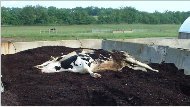
Figure 3. These fallen dairy cows have been placed in a composting structure, which is a good practice for disposing of fallen livestock when the approved state guidelines are used. These animals will be covered with 3-4 feet of bedding material to complete the pile, which deters vermin.