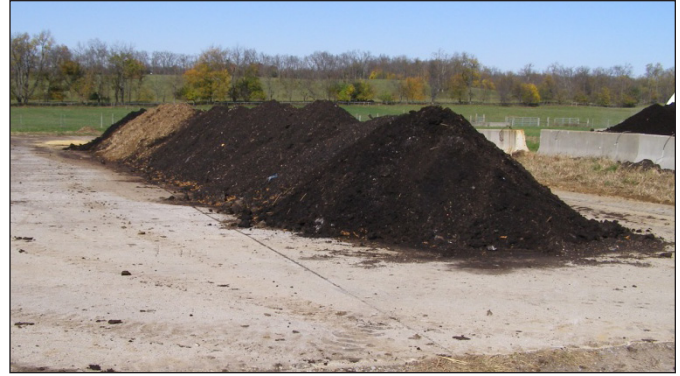
Figure 4. These livestock compost piles have been properly covered. The windrow system allows for easy access and creation.