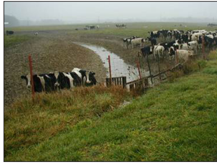
Figure 2. Cattle with full access to this stream have denuded vegetation, damaged stream banks, and polluted water resources.

Lagoons and liquid storages need to be managed to minimize the amount of clean water that can enter the system. Clean water reduces storage capacity, and—if not accounted for—this extra water can cause an overflow. Diverting clean water from roofs and headwaters away from storage structures and inspecting gutters and downspouts to make sure they are in good working order can help preserve storage capacity. Regulators require a manure storage facility to have a capacity that can handle the manure and runoff from the production facilities, normal rainfall events, a 24-hour 25-year storm event (which is about 5.25 inches of rain in Kentucky), and at least one foot