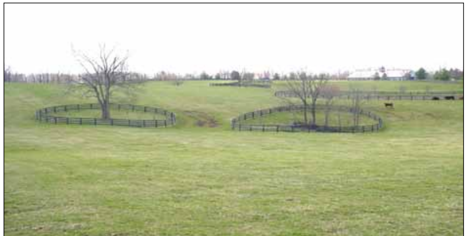
Figure 7. Livestock are excluded from these sinkholes, which protects animals and water quality.

Sinkholes in pastures are common in Kentucky. Livestock should be excluded from sinkholes and other karst features by fencing off the sinkhole's drainage area. Many Central Kentucky horse farmers already fence off sinkholes to protect animals from injury, but excluding livestock also protects water quality by preventing manure, sediment, and other pollutants from entering the sinkhole. Sinkholes should be fenced at least 25 feet out from the top rim of the depression, since it may be impractical to fence off the entire drainage area (Figure 7).