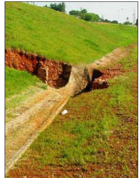
Figure 4. Water was channeled into this sinkhole, causing it to grow deeper and wider.

Disturbances such as soil or water movement near sinkholes can cause them to become unstable, which can result in the sinkhole deepening or widening and in some cases sudden surface collapse. Also, as more water enters a sinkhole, the potential for water resource contamination greatly increases (Figure 4). Landowners should attempt to reduce and/or slow down the water flowing into sinkholes by creating grassed waterways or placing riprap in ditches and gullies leading to sinkholes. In cases where water flows by sheet action, it is best to create a large vegetative buffer. As a last resort, landowners may want to install diversion ditches or grassed waterways that direct water away from the sinkhole, which slows the growth of the sinkhole and lessens the potential for water pollution. However, when diverting water, producers must consider where the runoff will be diverted to ensure that it doesn't cause additional erosion or water quality problems.