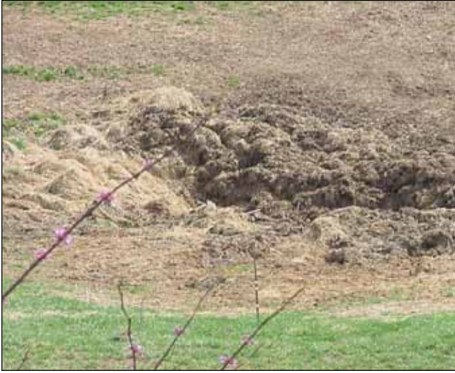
Figure 5. Manure dumped in this sinkhole can contaminate ground and surface water with both pathogens and nutrients.