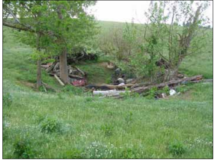
Figure 6. Dumping trash in a sinkhole can pollute ground and surface water.