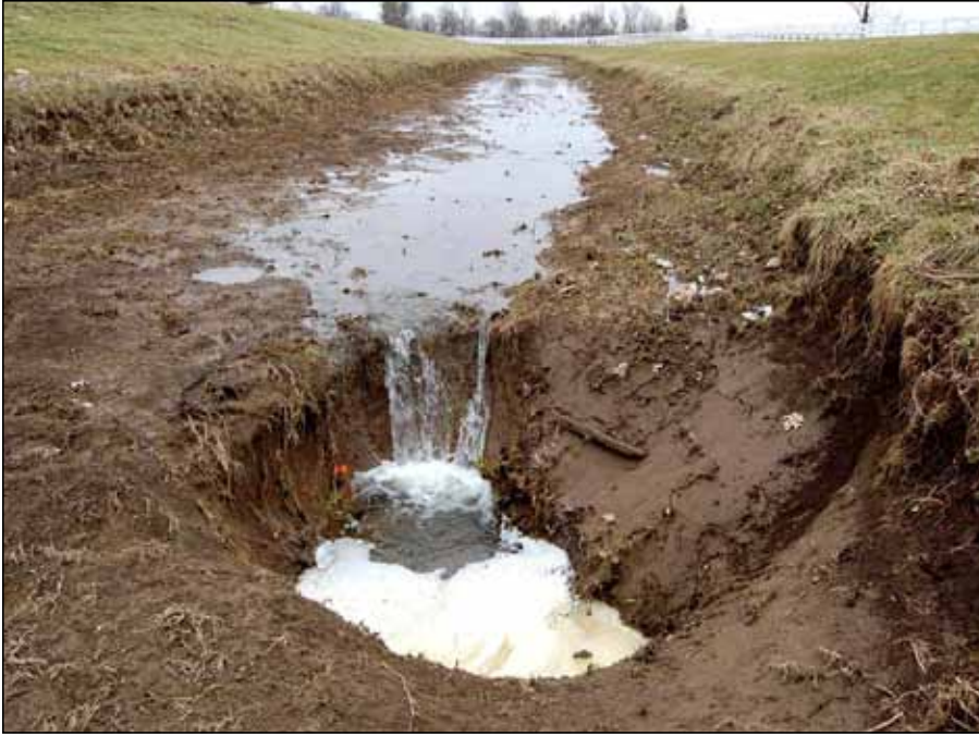
Figure 3. This swallow hole connects the surface stream to the underground water system and does not filter out contaminants, which allows them to enter the system rapidly.

the production area and may already have some vegetation growing around them, but this traditional vegetative buffer can often be expanded or more intensely planted. If it becomes necessary to remove invasive species or toxic plants near sinkholes, use mechanical means or spot applications of herbicides that are considered safe around water sources. Sinkhole buffers in crop areas may require the use of herbicide-ready plants or species that can tolerate the herbicides used on the crops.