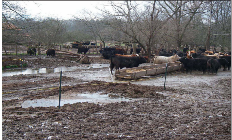
Figure 1. A poorly managed winter feeding area for cattle located along a stream is polluting valuable natural resources.

There are two types of documents used for nutrient management planning: a nutrient management plan (NMP) and a comprehensive nutrient management plan (CNMP). Generally, a comprehensive nutrient management plan is written by a professional other than the producer, is more thorough and detailed, and accounts for all aspects of nutrients on the farm. A nutrient management plan often is written by the producer and is a more basic, hands-on document. At this time, the difference between an NMP and a CNMP is a technical difference between the federal and state agencies requesting and developing the documents; however, the concept behind each document is the same.