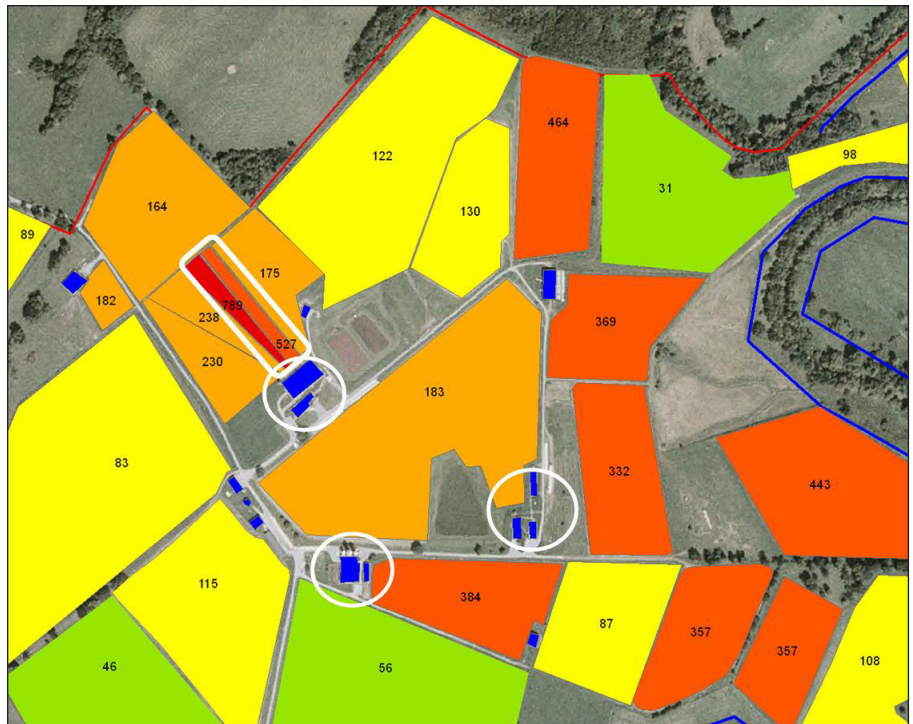
Figure 2. Significant increases in soil test phosphorus have occurred on this livestock operation immediately surrounding the production area (white circles) and accompanying dry lots (white rectangle).

The last calculation in this example showed that the producer would be applying a N:P ratio of approximately 2.1; however, the lowest ratio that a crop requires is 4.1 for corn for grain (Table 4). So if the producer was to calculate the application rate based on nitrogen removal, he would be applying twice as much phosphorus than the crop could remove. This means, under simple assumptions, there would be a build-up of phosphorus in the soil, which can lead to excess phosphorus contaminating ground and surface water resources.