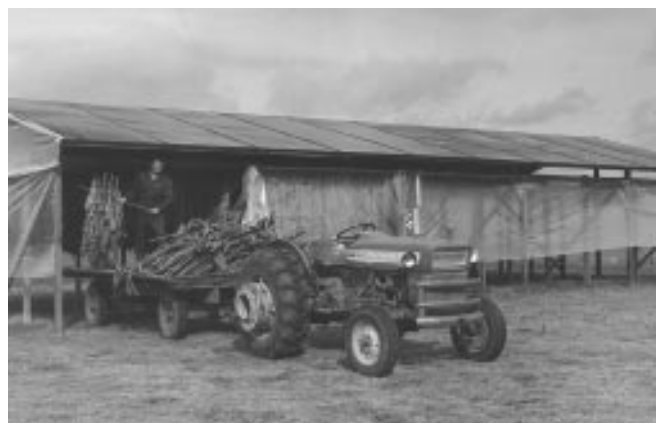
Figure 4. Cured tobacco can be easily bulked onto a wagon when in case for transport to a stripping room.