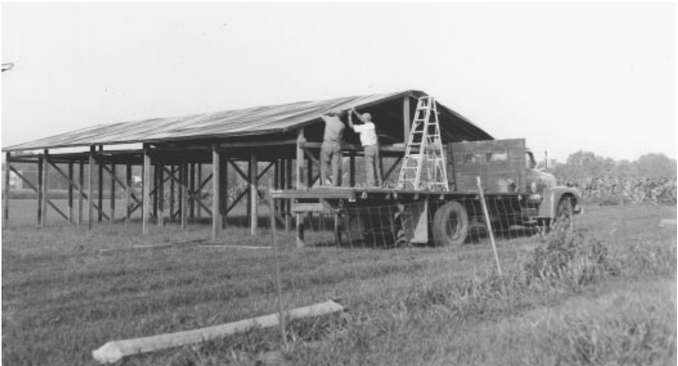
Figure 1. Construction of a pole-type plastic-covered curing structure.

Cured leaves at stalk positions toward the tip of the plant were slightly darker than corresponding leaves cured in the conventional barn, resulting in a $0.01 per pound lower market value for the tip grade. Since the tips were approximately three feet above the sod, the only apparent explanation for the darkened leaf is the high nightly humidity around the leaves and the high case of the tip leaves. Since the potential gain in value of this grade of tobacco was only $17 per acre (at 1968 prices), there is no apparent justification for any additional investment or labor to correct the situation other than selecting a well-mowed site with good water drainage and air movement.