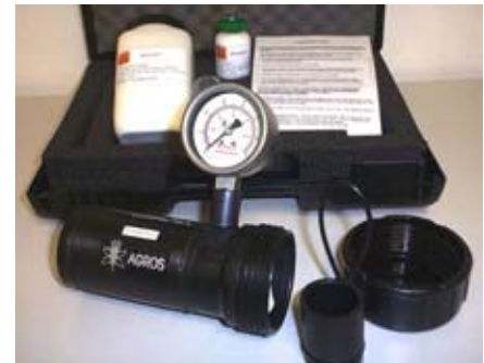
Figure 3. Agros® N Meter.

A powdered reagent containing calcium hypochlorite, calcium chloride, and calcium hydroxide is mixed with the slurry in a sealed chamber, and the N 2 gas produced is measured with a pressure gauge. Using Table 9, you will be able to estimate the NH 4 -N content of your sample by finding the corresponding values to the pressure gauge value you have just obtained with the Agros N Meter.