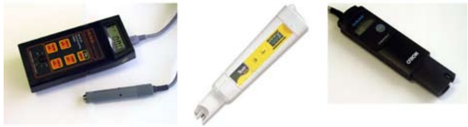
Figure 2. Conductivity meter (Hanna) and conductivity pens (Oakton, Orion).

To measure the EC of a manure sample, you simply place the EC probe in the slurry and read the EC from the meter. Mix the sample thoroughly before placing the probe in the slurry. Using Tables 5 to 8, you will be able to estimate the NH 4 -N content of your sample by finding the corresponding values to the EC number you have just obtained from the conductivity meter or pens. Electrical conductivity meters/pens need to be periodically calibrated. Calibration kits can be purchased from laboratory supply dealers.