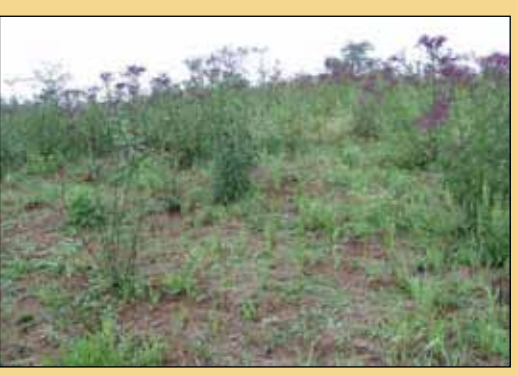
Figure 2. Weed control is often necessary in the establishment year due to slow aboveground growth.