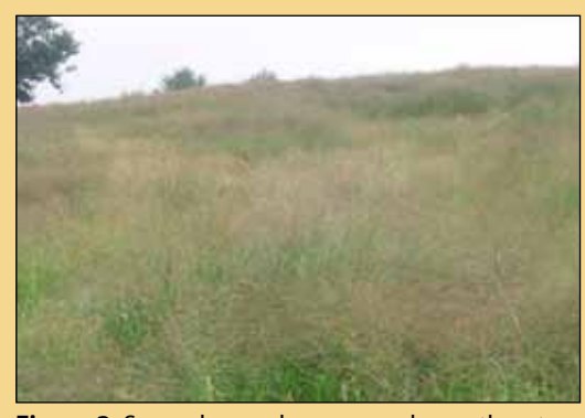
Figure 3. Second-year aboveground growth outcompetes most weeds.