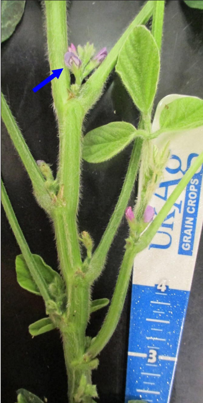
Figure 6. Soybean plant at R1 growth stage—beginning flowering, with one flower open (blue arrow) anywhere on the main stem. The open flower is at the seventh node.