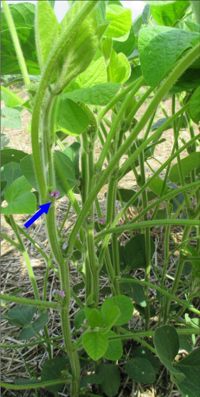
Figure 7. Soybean plant at R2 growth stage—full flowering, with an open flower on the main stem at one of the top two nodes with a fully developed trifoliate leaf. The open flower (blue arrow) is at the second node from the top on the main stem.