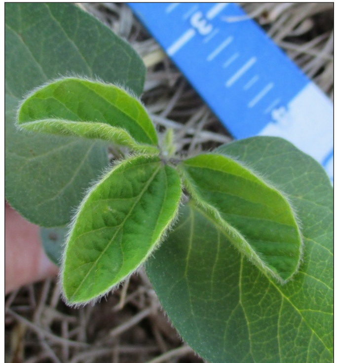
Figure 4. Soybean plant at V1 growth stage.