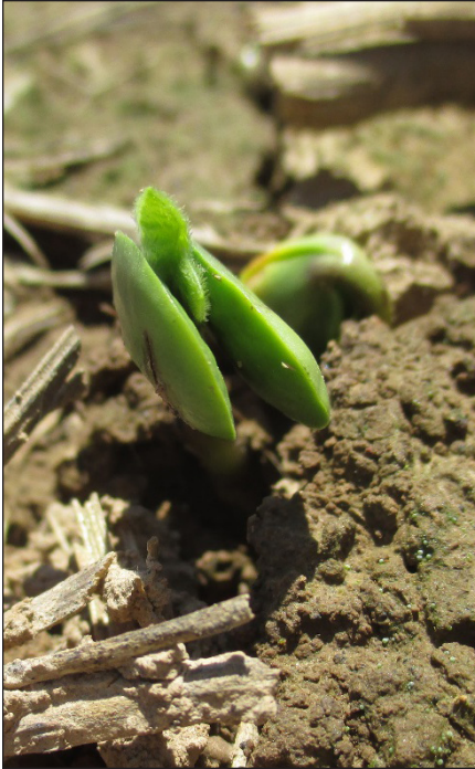
Figure 1. Soybean plants at VE growth stage. The cotyledons (bean) of the plant in the foreground are separating to expose the developing unifoliate leaflets. The plant in the background is often referred to as "poking through": The stem (hypocotyl) and part of the bean are visible.