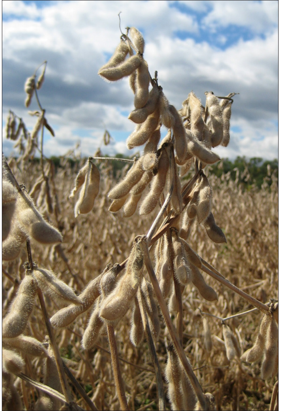
Figure 13. Soybean plants at R8 growth stage.