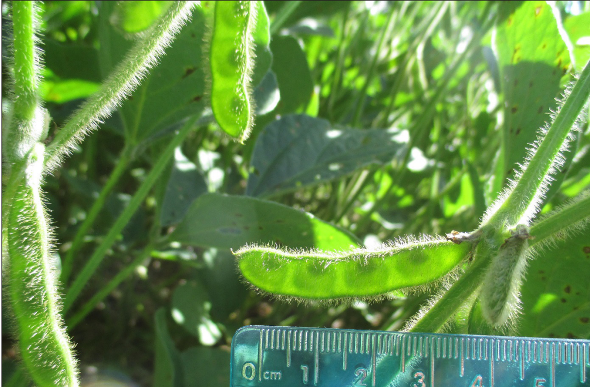
Figure 10. Soybean pod with seed that is approximately 3 mm long. Soybean plants with a 3 mm long seed at one of the top four nodes of the main stem are at R5 growth stage.