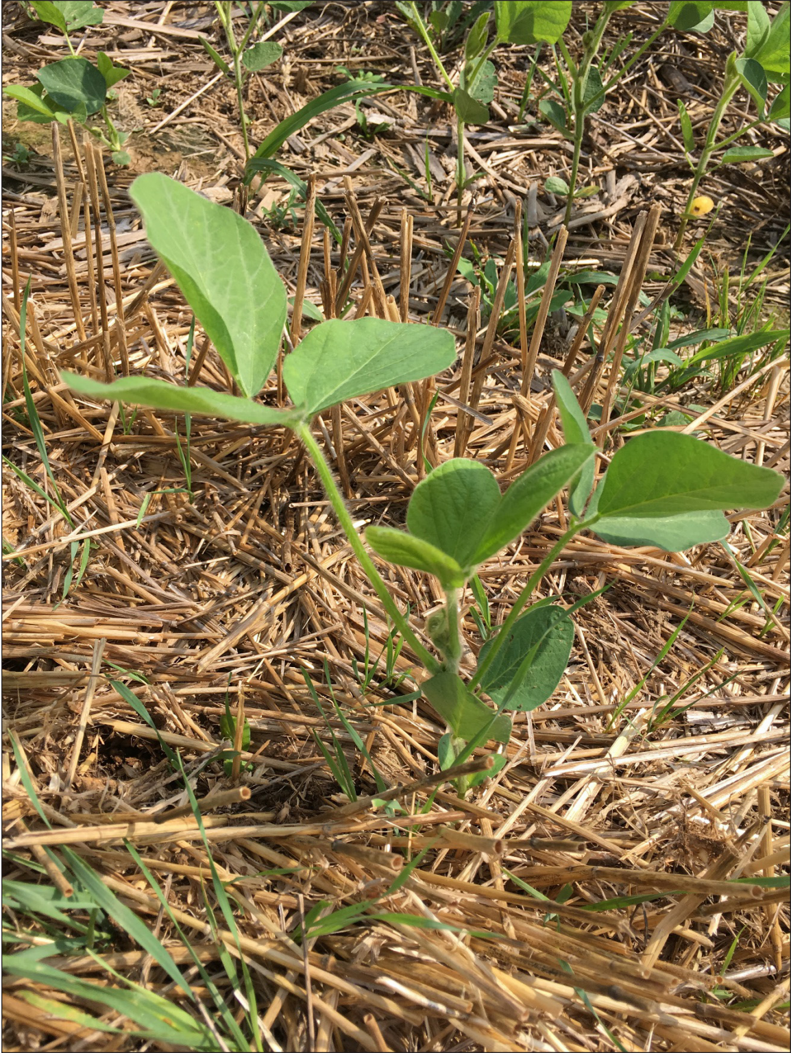
Figure 5. Soybean plant at V3 growth stage. Three trifoliate leaves are fully developed.