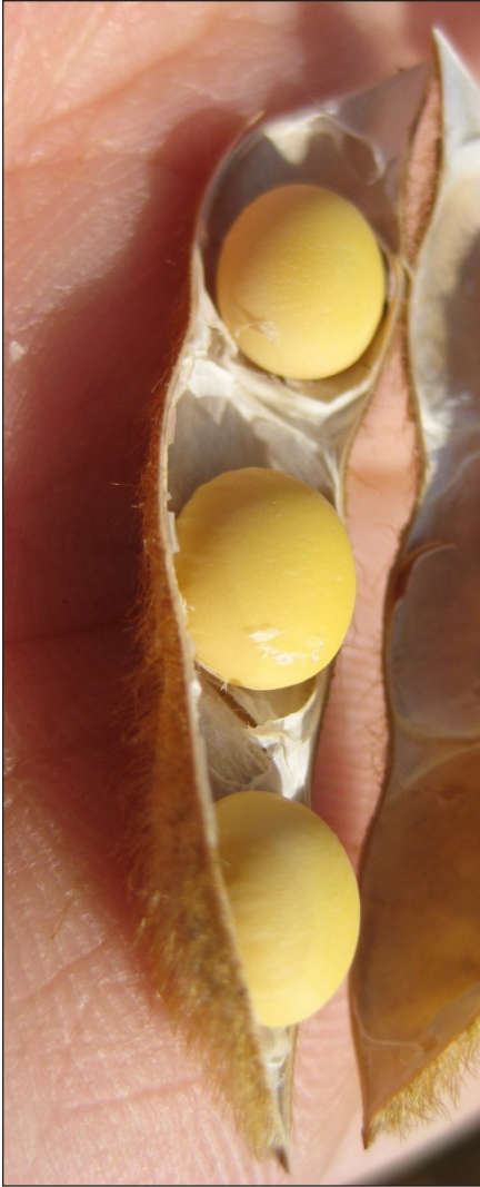
Figure 12. Soybean seed and pod at R8 growth stage.