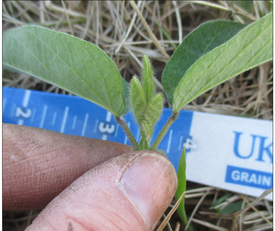
Figure 2. Soybean plant at cotyledon (VC) growth stage. The two unifoliate leaves are fully developed while the first trifoliate leaf is not fully developed: Leaflet edges are still touching.