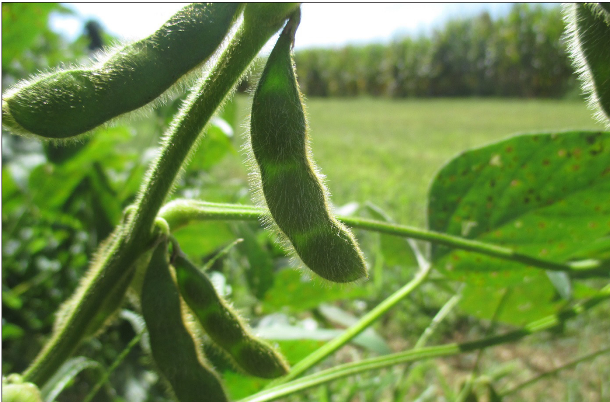
Figure 11. Soybean pod with green seed filling the pod cavity. The R6 growth stage occurs when green seed fill the pod cavity at one of the top four nodes on the main stem.