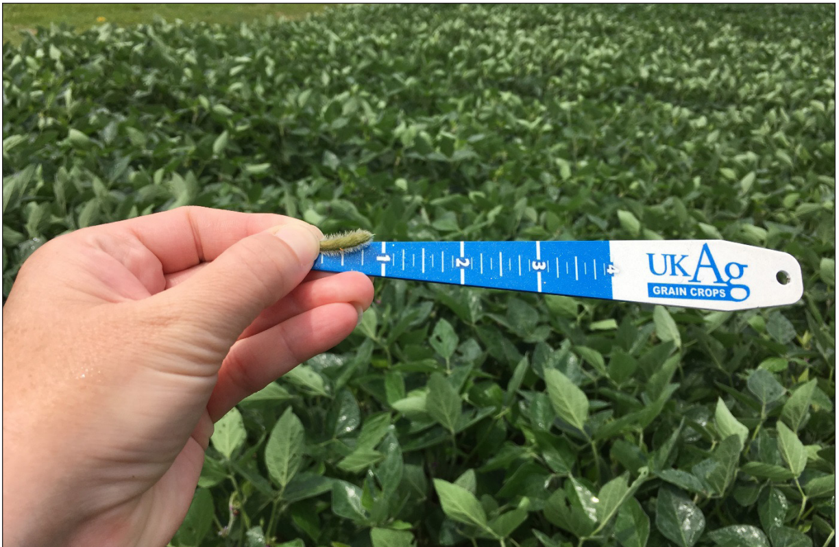
Figure 9. Soybean pod is approximately 2 cm (3/4 inch) long. Soybean plants are at R4 growth stage when a 2 cm pod is at one of the top four nodes of the main stem.