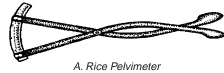
A. Rice Pelvimeter