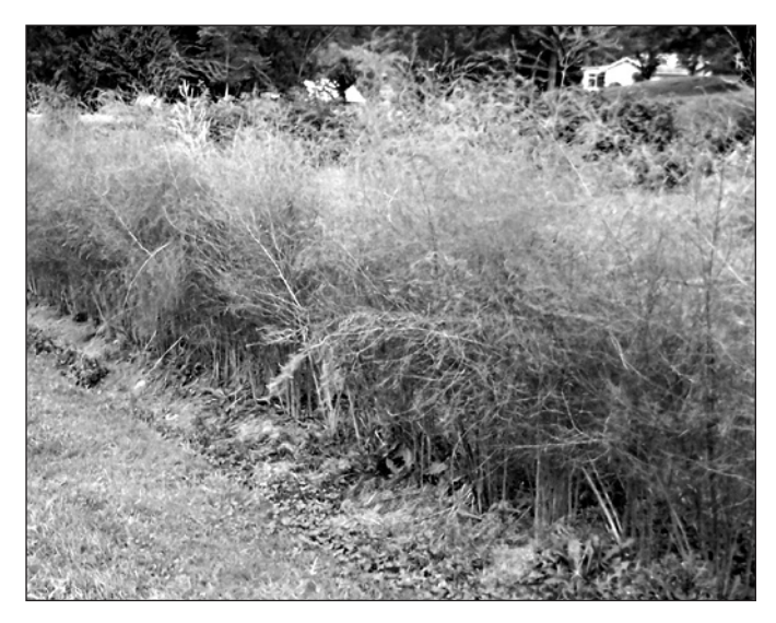
Plants exhibiting Cercospora, a foliage disease.

Cercospora (needle blight) caused by Cercospora asparagi is a very destructive disease in the south-central and south-eastern United States. It has become a serious problem in the all-male hybrid cultivars. The dense lush foliage of the male hybrids creates a humid environment, and in wet years defoliation and fern death may occur. A severe infection will result in yield reduction the following year by weakening the crowns.