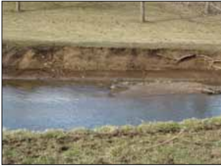
Photo 1. Riparian buffer and stream bank damaged by livestock in central Kentucky.