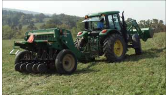
Figure 6. The filter strip was planted with seeding equipment borrowed from the local Cooperative Extension office.