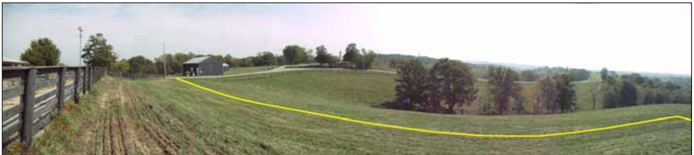
Figure 4. The yellow line delineates the recently-seeded 60-foot buffer zone established next to the facility shown in Figures 2 and 3.

For the facility shown in Figures 2 and 3, a blend of orchardgrass and timothy was selected as the warm-season grass, and a perennial rye was interseeded to provide a cool-season grass in the same area. The strip was established in the fall by first spraying the area with 2,4-D herbicide to remove broadleaf weeds (Figure 5) and then interseeding the mix into a stand of tall fescue (Figure 6).