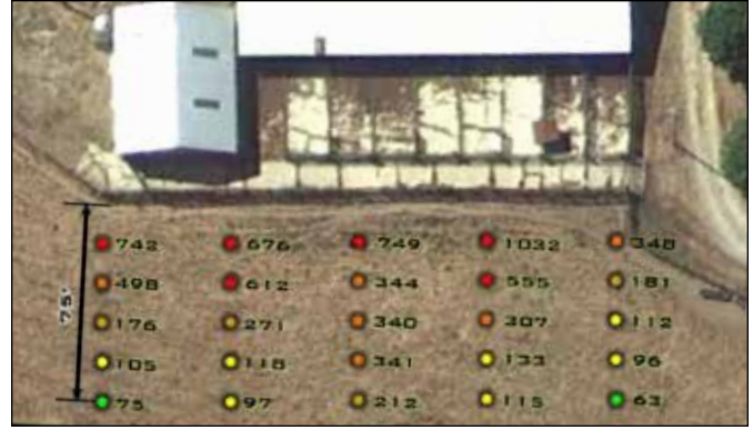
Figure 3. Aerial view of the concrete cattle feeding facility with soil test phosphorus (STP) levels shown for the adjacent pasture.

Nutrients, pathogens, and sediment moving off-site from the livestock facility shown in Figures 2 and 3 could be trapped, treated, and removed by installing enhanced vegetative strips along the edge of the concrete pad and into the adjacent pasture. If implemented correctly, the width of the strip should coincide with the width of the facility (or the drainage area), and the strip should extend far enough to capture pollutants from the runoff until phosphorus levels have decreased to natural levels.