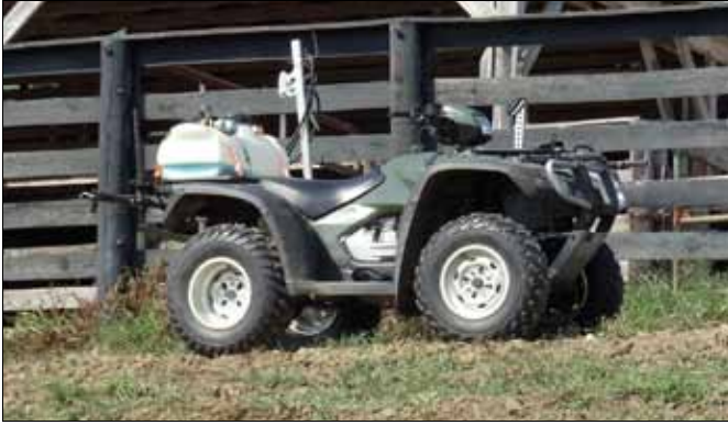
Figure 5. Broadleaf weeds were removed from the proposed filter strip area using this ATV, equipped with a spray boom.