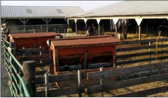
Figure 2. Water that runs over this concrete cattle feeding area picks up nutrients and other pollutants that can flow to surface water if not controlled.