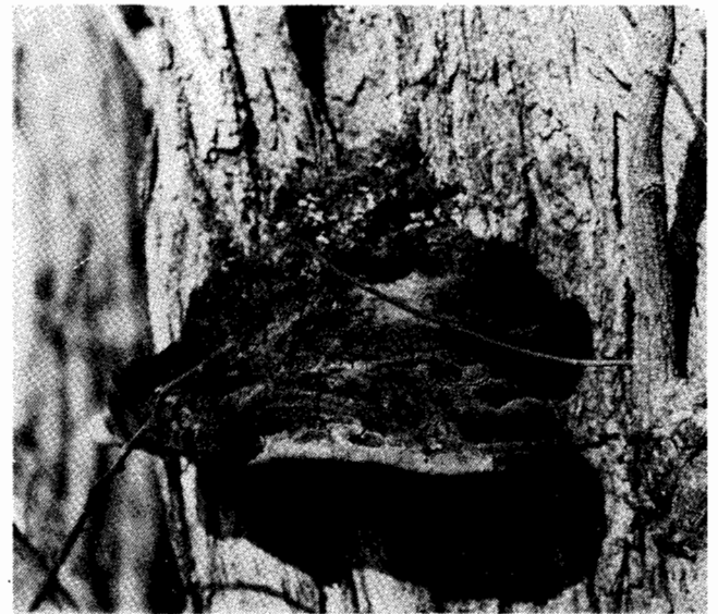
Figure 4.—A conk (fungal fruiting structure) is a visible sign of decay in trees.

● Deteriorating branch stubs, along with weak sucker growth, make topped trees highly vulnerable to wind and ice damage.