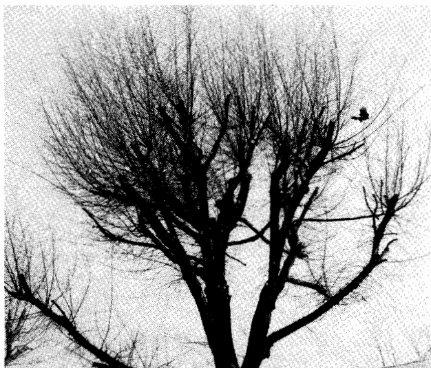
Figure 5.—Dense, upright branches develop as a result of topping.

allow the sun to shine in their gardens. Species used there such as London plane and linden can survive many such topplings. Since a good selection of low growing landscape trees is available now, there is no need for constant pruning to maintain low growth. Topped trees are unnatural substitutes for shade trees meant to offer several lifetimes of beauty and enjoyment.