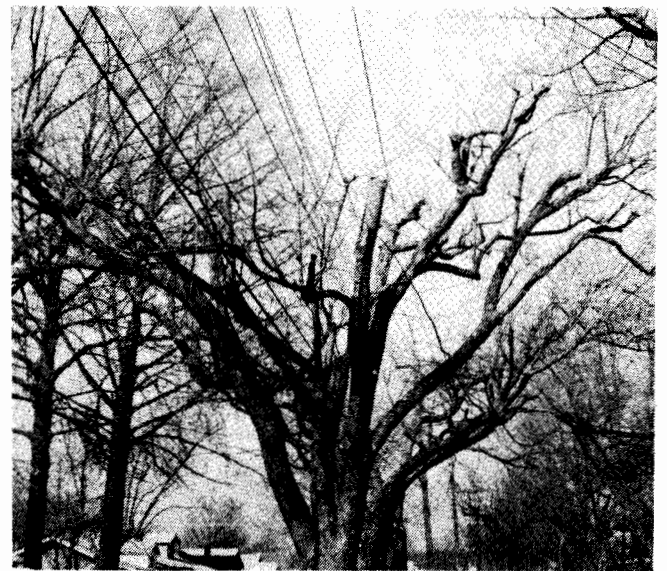
Figure 2.—Trees are often topped to eliminate interference with utility lines.

Large, mature trees are often topped to prevent interference with overhead utility wires (Figure 2).