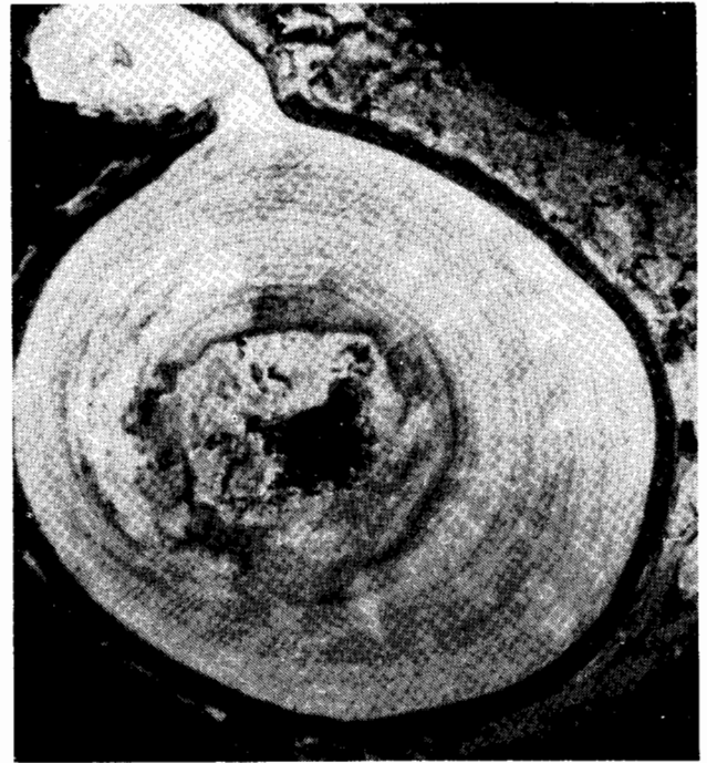
Figure 3.—Internal decay, often not visible from the outside, weakens tree limbs.

● Some tree species (e.g., sugar maple, oak and beech) do not readily produce water sprouts. Without the resulting foliage, a bare trunk results and the tree quickly dies.