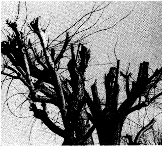
Figure 1.—A tree that has been topped. DO NOT do this to your trees!

Topping is the drastic removal or cutting back of large branches in mature trees. The tree is pruned much as a hedge is sheared and the main branches are cut to stubs (Figure 1). Topping is also referred to as heading, stubbing or dehorning.