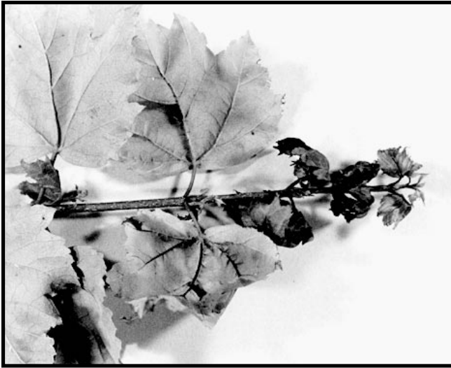
Figure 3.—Shoot tip dieback of maple resulting from anthracnose infections.

Symptoms on sugar maple can be confused with scorch symptoms. Twig infections result in blighting and death of shoot tips (Figure 3).