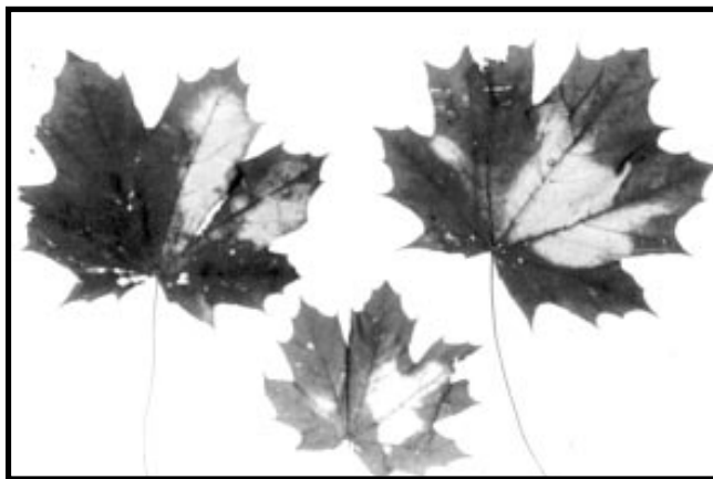
Figure 2.—Anthracnose of maple showing dead areas along the leaf veins.