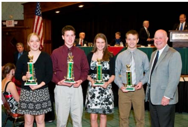
Market Poultry division, top team Pennsylvania Poultry Judging team