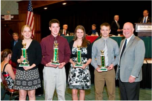
Market Egg division, top team Pennsylvania Poultry Judging team