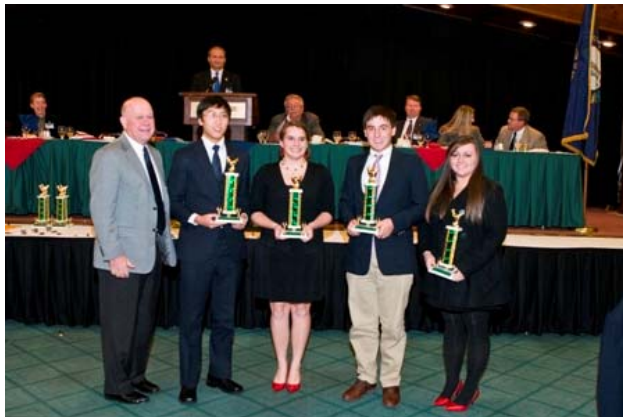
Production Hen division, top team Georgia Poultry Judging team