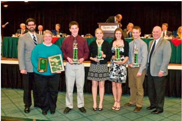
Top team overall, Pennsylvania