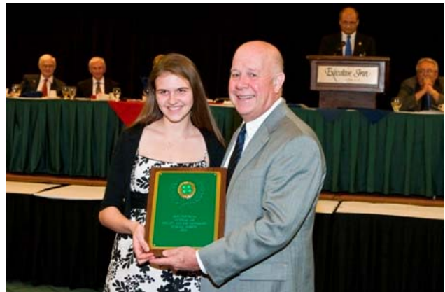
Top individual overall