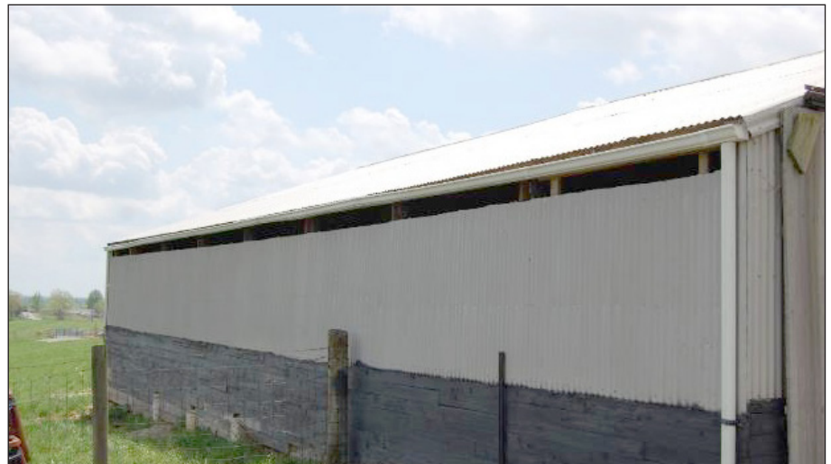
Figure 5. The backside of the structure after sheet metal was removed to improve airflow.