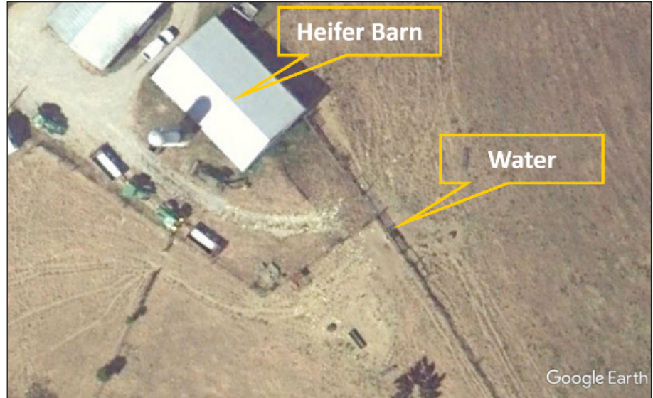
Figure 1. Old Sheep Barn on the Eden Shale Farm in Owen County, Ky. There are adjacent pastures just beyond the edges of this picture.

A demonstration of land- and water-use planning is this example from a working farm. The Eden Shale Farm, in Owen County, Ky., has an old structure