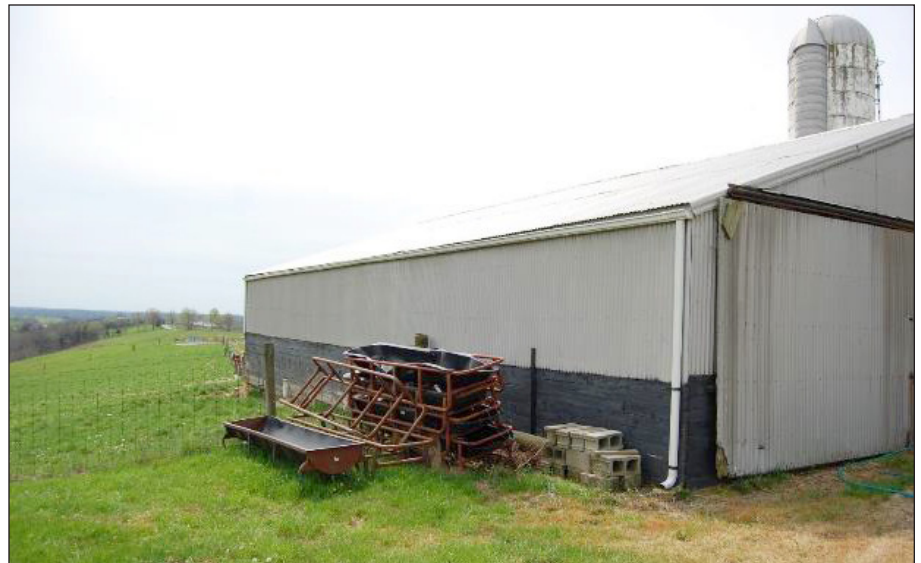
Figure 4. The backside of the structure before removing sheet metal to improve ventilation.