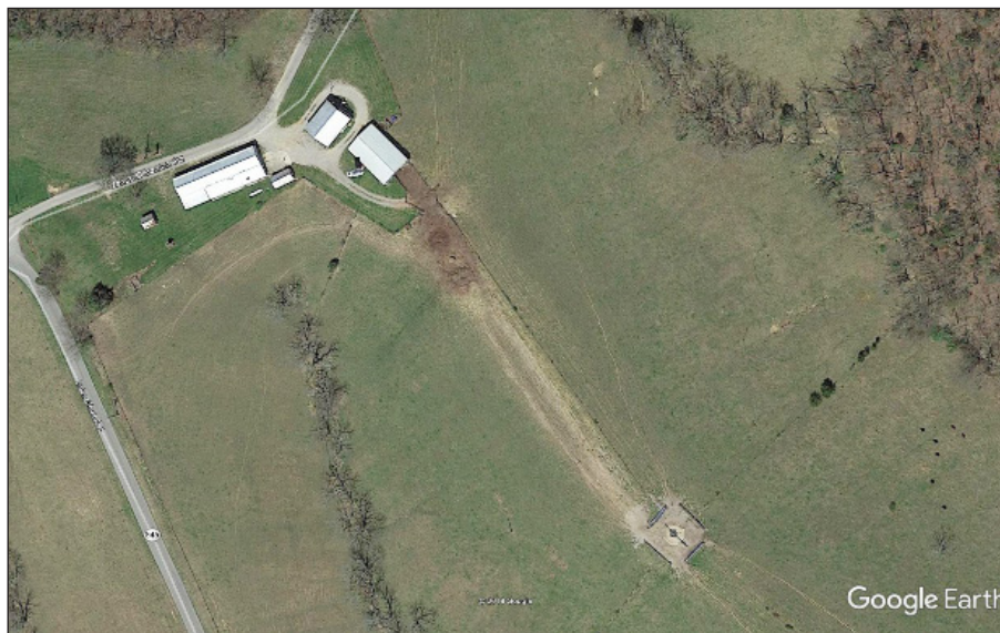
Figure 8. An aerial view of the heifer barn complex with its four-way waterer.

A typical cow-calf operation needs to feed and water cattle on a daily basis. This is accomplished by rotating cattle from field to field and providing them with a convenient water source. Cattle operations can manage cattle better when facilities are designed to meet the needs of cattle and the producer. At Eden Shale, an existing structure, a used construction tire, and surrounding pastures were used to reduce capital costs and create an automated system. This system implemented as part of this case study used free energy in the form of prevailing winds, gravity, solar energy, and precipitation. Installing a watering station that served four pastures allowed the producer to easily move cattle from field to field and saved time. In