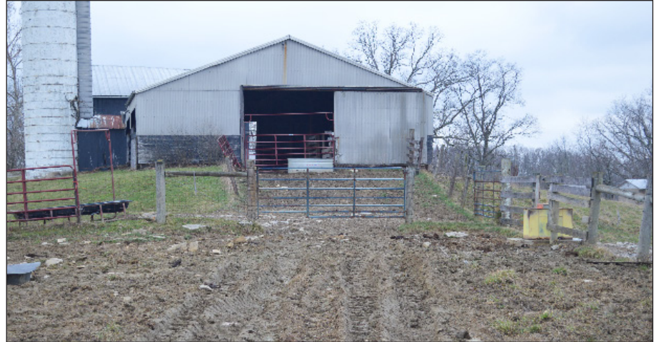
Figure 2. Entrance ramp and automatic watering fountain before renovating the southern end of the structure.

that was once used as the sheep barn. (Figure 1). An abandoned silo bisects the open, southwestern side of the structure. Animals get into the structure by ascending a slope at its southern end. Several pastures and a city-fed water fountain (figures 1 and 2) are adjacent to the structure. Many pastures are in a rotational grazing schedule, which incorporates these four pastures. The structure is used to house