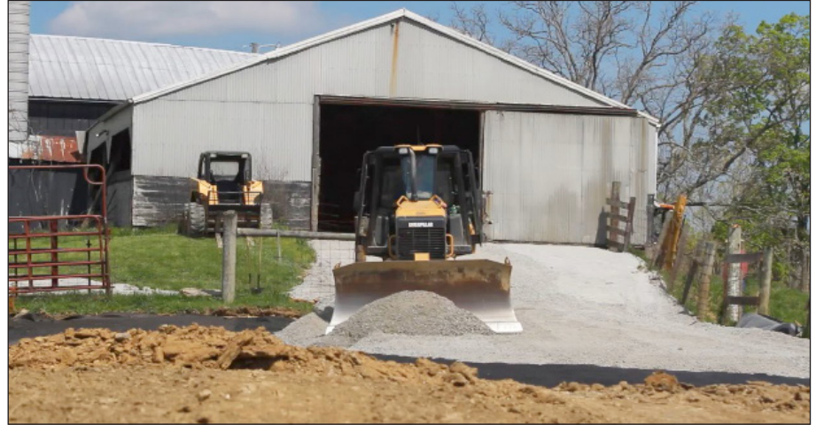
Figure 3. Heavy-use area being installed in the gateway into the pasture and ramp into the structure.

Drinking water was improved by creating a water-harvesting system with improved access to a watering station. Rainfall harvested from the roof provides the drinking water for stock, when they are in this area. The 40 by 60 structure captures approximately 1,500 gallons of rainwater with each inch of rainfall. To create the system, the downspouts from the southwest were routed into two 2,000 gallon cisterns, which were placed on the southwest side of the structure. The downspouts from the northeast side were routed through the structure to also drain into these cisterns (Figure 6). Water captured in the cisterns is pumped into the silo, which was sealed with hydraulic cement to store water. The total volume of the system is approximately 6,000 gallons. This volume matches the requirements for 30 cow-calf pairs, or approximately 5,300 gallons, with a buffer of 700 gallons. Assuming Kentucky averages four inches