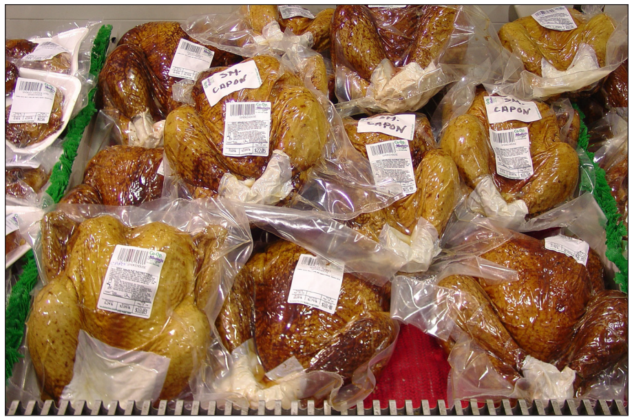
Figure 2. Smoked capons in the display case of a store. Jacque Jacobs.

When chickens take longer to reach market weight the older meat tends to become rather coarse, stringy, and tough as the rooster ages. Caponized males grow more slowly than normal male chickens and accumulate more body fat. Deposits of fat in both the light and dark meat of capons is greater than that of intact males resulting in a meat that is more tender and juicier. The older the age at which capons are slaughtered the more flavorful the meat. With major improvements in the genetics of meat breeds, caponization is not necessary. The fact it is a surgical procedure makes it difficult and expensive and raises ethical concerns.